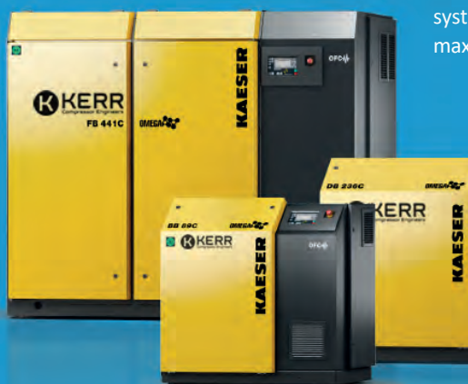
KAESER OMEGA Rotary Blower Packages

KAESER oil lubricated/oil free rotary screw compressors and blowers, feature the very latest energy saving motors and drive systems, thereby delivering maximum performance and energy efficiency