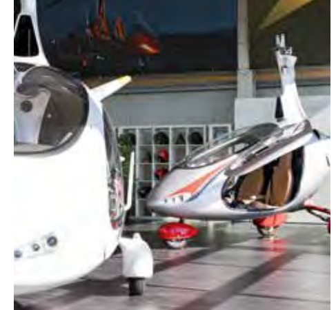
The gyroplane before the rotor is fitted.

Thanks to its design, the gyrocopter flies with very special and unique characteristics, making it one of the safest aircraft of all. Unlike fixed-wing aircraft, there is no danger of stalling or tailspin. Even in the event of engine failure, the Autogyro retains full control capability and merely loses altitude slowly; it is therefore still able to perform a controlled landing. Almost like no other rotorcraft, the Autogyro can even be flown in strong winds and can be used practically all year round. As extreme low speed is possible, the gyroplane is ideal for excursions and day trips. Moreover, the sky’s the limit when it comes to the design. It can be customised in any way, from a company logo to a family coat of arms or a distinctive colour coating. The company even received an unusual commission to embellish an AutoGyro with gold leaf and Swarovski stones, recalls Judith Reichardt, who is responsible for marketing and communication. Best of all: the innovative rotorcraft runs at one tenth of the cost of operating a helicopter. Depending on the road traffic regulations, in some countries you can even roll up to a service station and fill up with Super Plus petrol, Judith Reichardt adds.