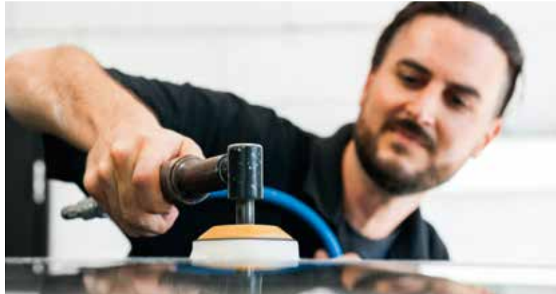
Compressed air is indispensable in powering the tools used in the car repair shop.

Without compressed air, the repair shop grinds to a halt.