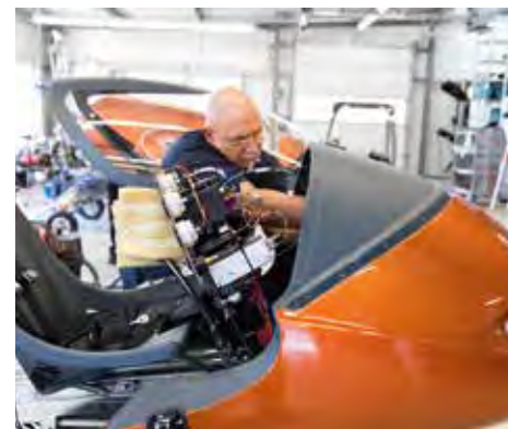
Final cockpit assembly: installation and connection of the aircraft’s avionics equipment.

Four years ago, the station needed to be expanded once again since compressed air was also needed on-site for the assembly line in the plastics processing department located across the road. A further two SM 12 AIRCENTERS were installed for this purpose. A wise decision as the station now runs “smoothly and to our complete satisfaction”, according to René Stecher.