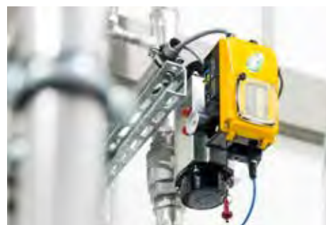
The air-main charging system prevents overloading of the system and contamination of the compressed air network when the system is restarted.