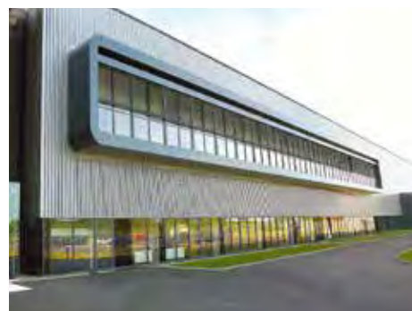
FACC manufactures engine components using lightweight construction techniques here in Reichersberg