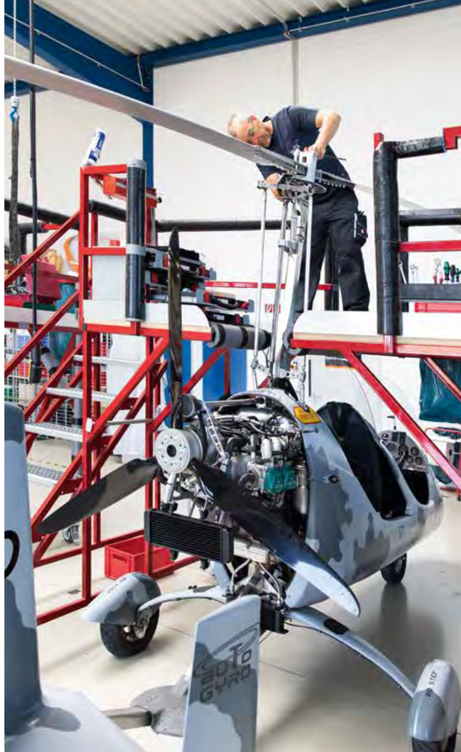
Approximately 90% of the components are manufactured on-site.