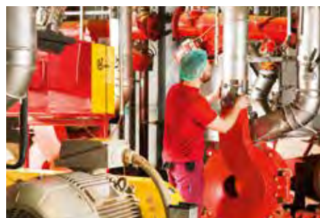
Compressed air is needed in every step of product processing. Shown here: material conveying.

Lower Saxony will continue to supply them with high-quality herbs and spices long into the future.