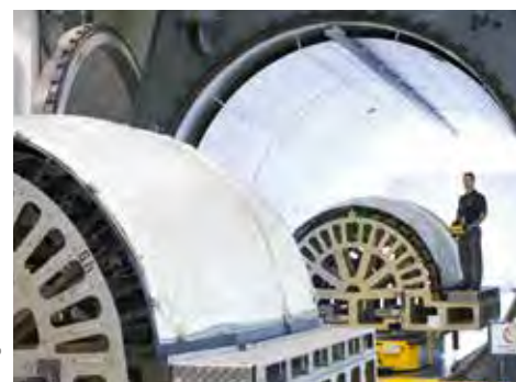
The engine nacelles are hardened in the autoclave to attain their final material characteristics.

lightweight components made up of hundreds of layers, and in some cases more than a thousand. Experts precisely calculate the stresses in advance – experienced by an engine nacelle, for example – to determine the exact number of layers needed at every location. This results in components that combine the toughness needed for the heavy demands of aviation with the minimum achievable weight. Another advantage of carbon: there is practically no thermal expansion. “An aircraft taking off in a hot desert region will be exposed to an ambient air temperature of minus 50°C just 20 minutes later,” says Christopher Jell, the Senior Manager of IE & FM Engines & Nacelles. “Our carbon components handle these rapid and extreme temperature fluctuations without the slightest difficulty”.