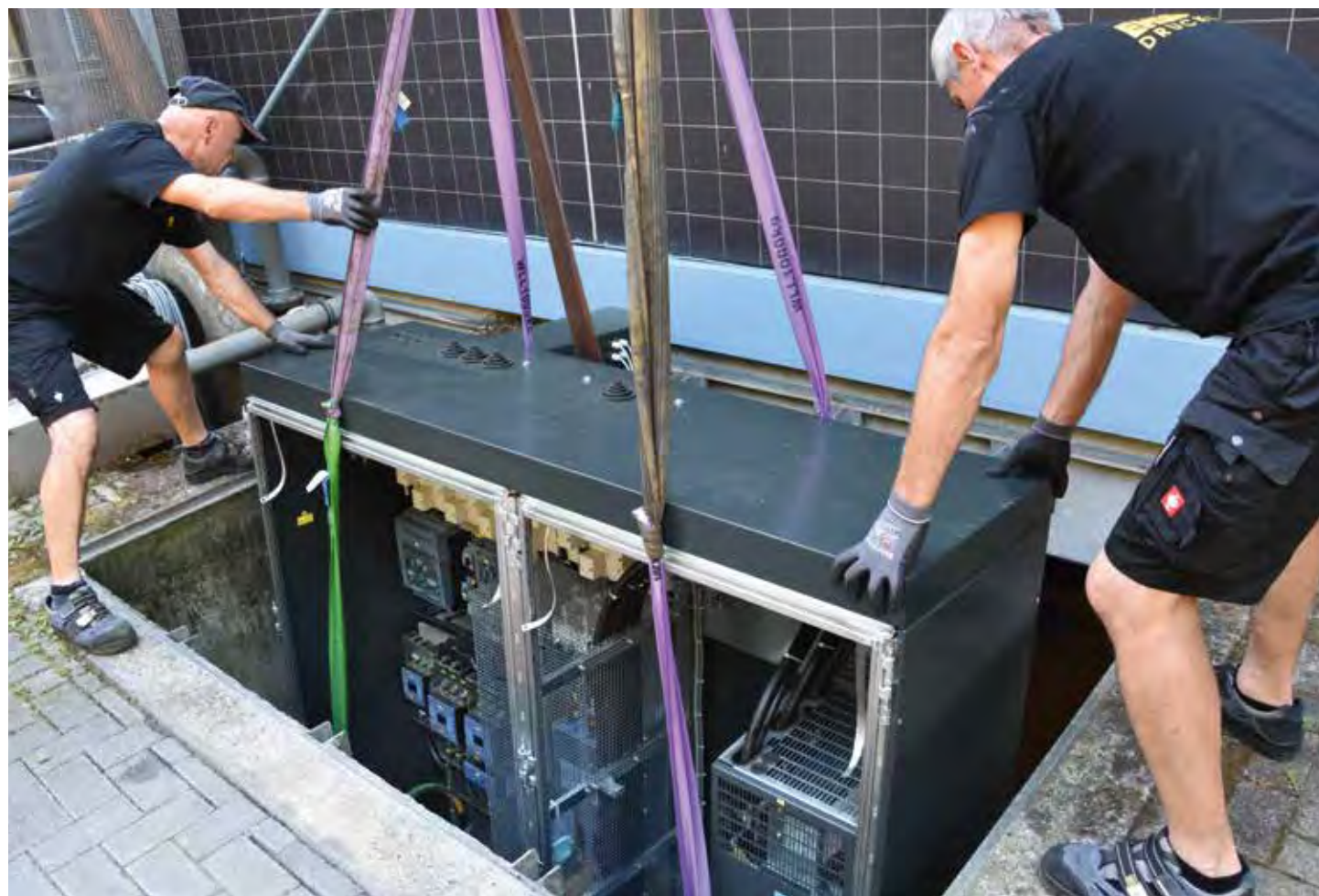
The body of the compressor unit had to be guided carefully through the light shaft.

exposed steel skeleton – an unequivocally modernist design. The building in which the laboratories are currently accommodated is now a listed architectural heritage site.