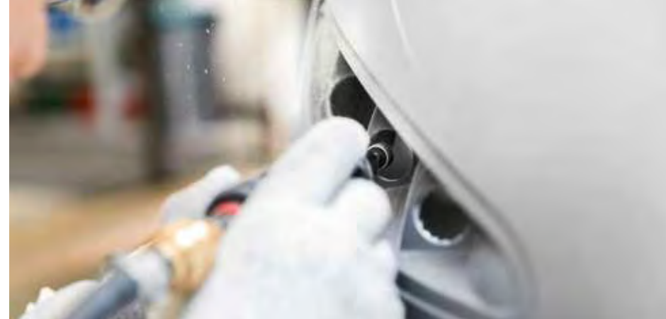
Compressed air is used to power almost every production stage.

Attracting a good deal of attention, the secret of the rotorcraft’s growing popularity lies in its innovative drive technology. Although the gyro resembles a helicopter, the rotor uses the air stream – rather than an engine – to start the rotation process passively. Known as autorotation, this generates the buoyancy of the gyroplane. The aircraft is driven by a propeller engine.