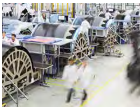
Up to 1000 or more layers of carbon composite material are combined to produce engine nacelles.