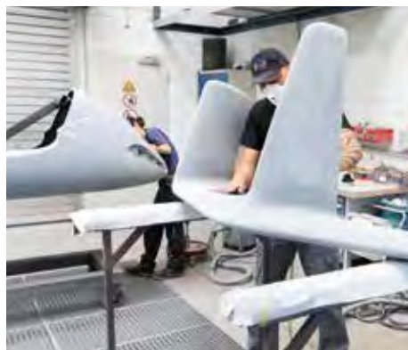
The tail units are also produced in the factory at Hildesheim Airfield.

the Red Dot Design Award in 2012. Last year, the exceptional design of the sleek planes received yet another accolade: the “MTOsport” won the coveted “Best of the Best” 2018 Red Dot Design Award, which officially attested to the ultra-light aircraft’s “innovative symbiosis of aesthetics and function”.