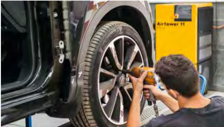
Powering the air impact wrench...