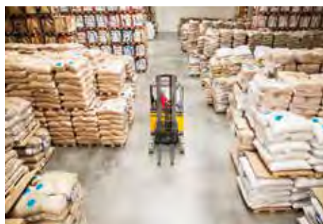
The air in the 10,000 m² warehouse is heavy with the scents of the many herbs and spices stored there.