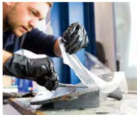
Emphasis is placed on maximum precision in the individual production stages.