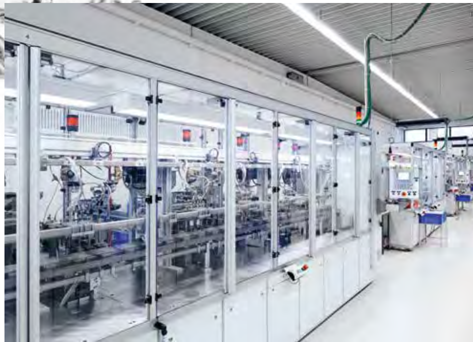
The Müllheim production site uses compressed air as an energy source for every aspect of its manufacturing operations.

the company's 6.25-hectare site. Therefore, the production area has been extended to include a new manufacturing hall. Since the Müllheim production site uses compressed air as an energy source for every aspect of its manufacturing operations, a dependable supply of quality compressed air with precisely defined parameters is of the utmost importance. In addition, some of the compressors in the existing compressed air stations were obsolete; these also needed replacing as part of the modernisation program. As a first step, an air demand analy-