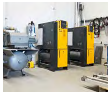
The KAESER station provides the necessary supply of compressed air.

From spray painting to grinding, the pressing processes and the CNC machines, the majority of the production stages require compressed air.