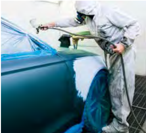
...and the spray paint booth.