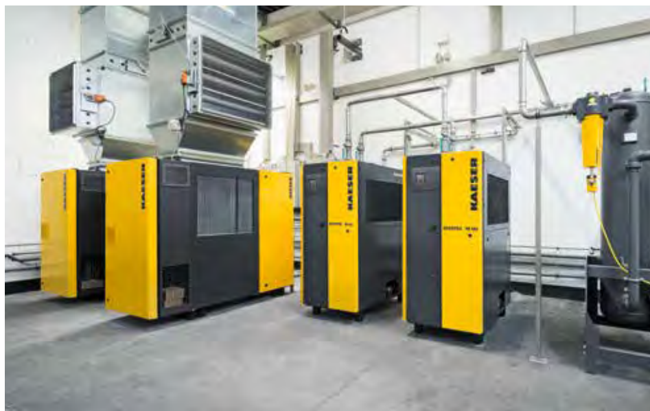
The compressed air supply meets the stringent requirements of Quality Class 1.4.1 in accordance with DIN ISO 8573-1.

needs compressed air. Consequently, the company cannot afford any bottlenecks or disruptions in the compressed air supply. The reliability and availability of this universal energy source is of paramount importance. When it was time to replace the obsolete compressors from another manufacturer due to increasingly frequent breakdowns and problems, the obvious choice was the Coburg-based system provider KAESER. For food processing operations, compressed air must meet the highest quality standards of Class 1.4.1 under DIN ISO 8573-1. The Fuchs Group compressor room now houses all of the equipment needed for energy-efficient compressed air production in accordance with those stringent requirements: Two new-generation ASD 40 rotary screw compressors with an integrated PTG 40-25 heat recovery system and two TE 102 energy-saving refrigeration dryers. The decisive