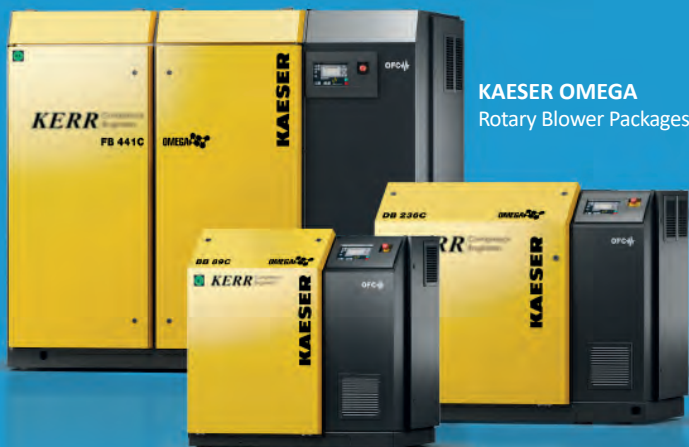
KAESER OMEGA Rotary Blower Packages

KAESER oil lubricated & oil free rotary screw compressors feature the very latest energy saving motors and drive systems, thereby delivering maximum performance and energy efficiency