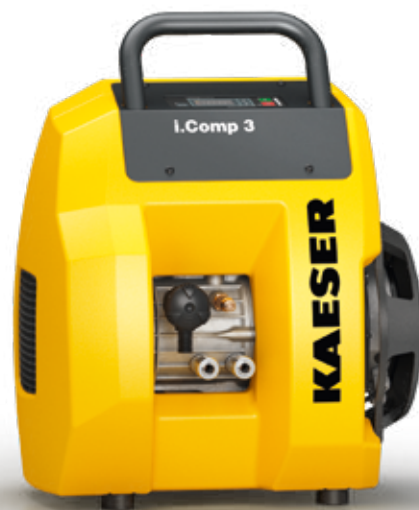
Fig.: i.Comp 3