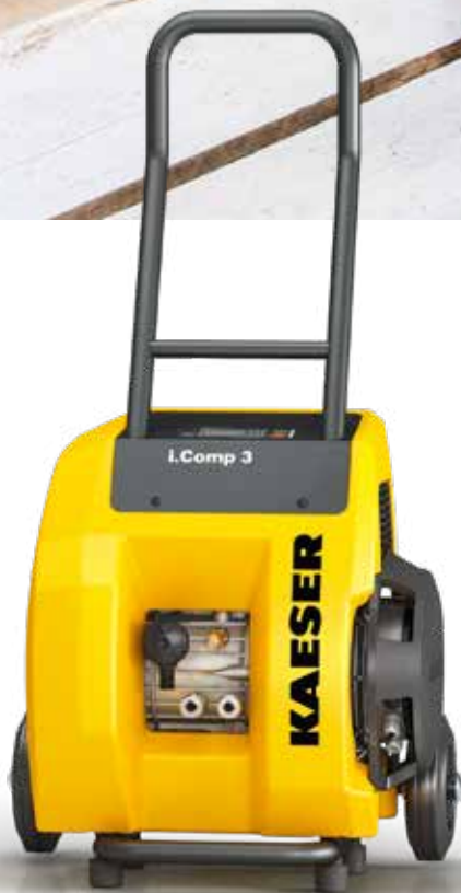
Fig.: i.Comp 3