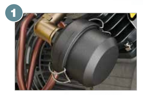
Silenced air intake filter